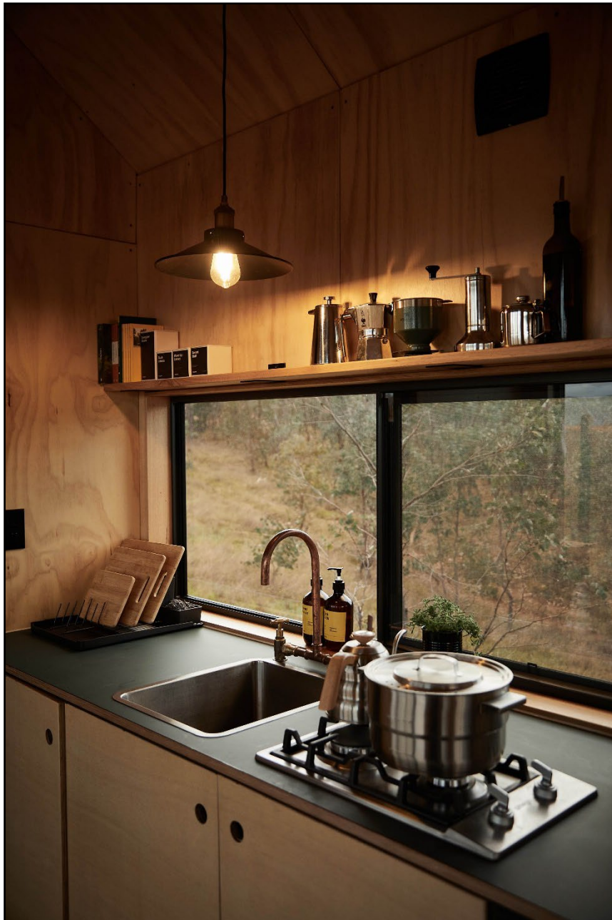
Figure 2: View of the standard cabin kitchen facilities.

Maintenance will be performed at the cabins on a regular basis in between bookings or during periods of vacancy. Cleaners will be tasked with the upkeep of the cabins in between bookings and perform a review of the cabins' facilities at every checkout.