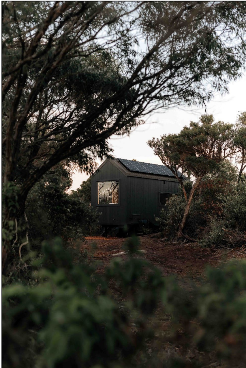
Figure 1: Front view of one of Unyoked cabins in Southwest WA.

1 bedroom cabins; maximum of 2 guests allowed per booking and a standard booking duration of 2 nights (representing most bookings). Each cabin will be serviced with a composting toilet, a small bathroom/shower and small kitchenette.