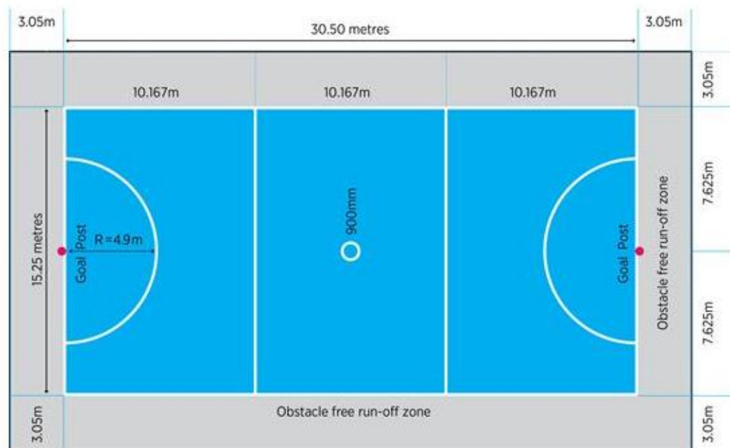
Single Court Layout