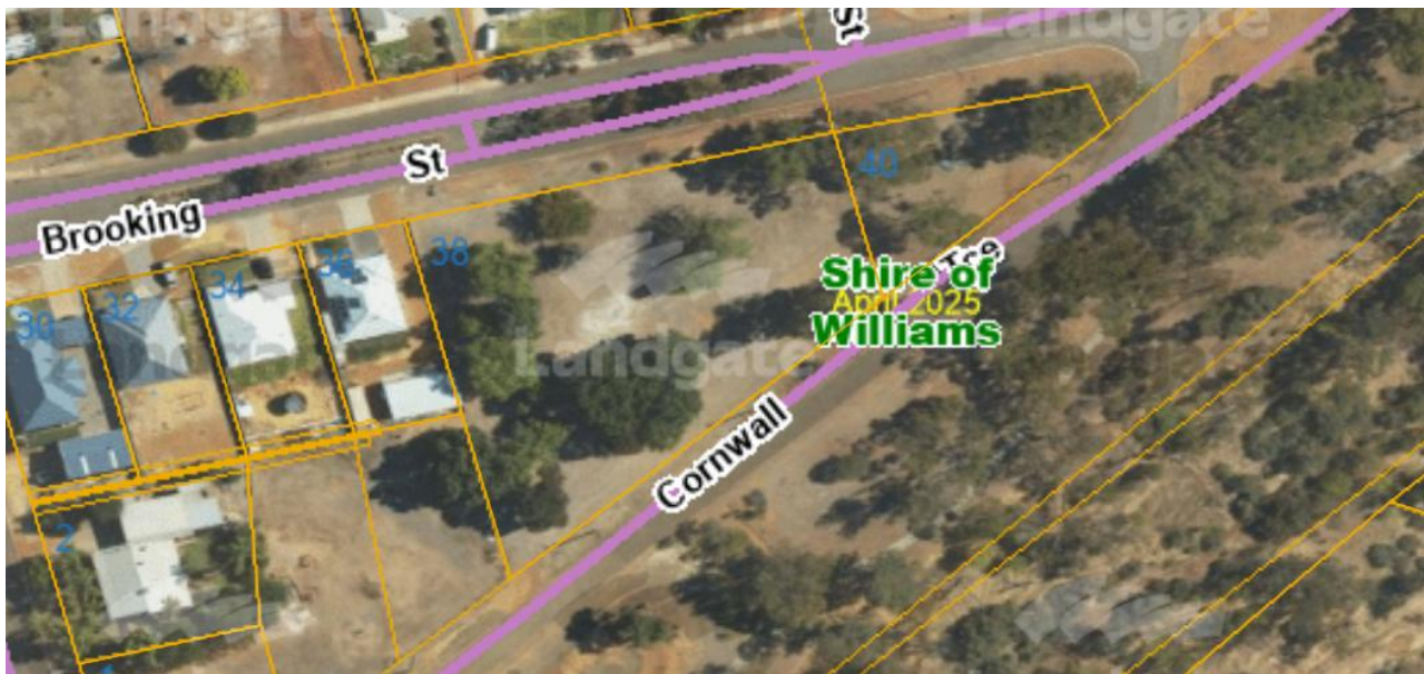
Figure 3 - 38 - 40 Brooking Street Zoned for public purpose

Recommended conditions of subdivision are,