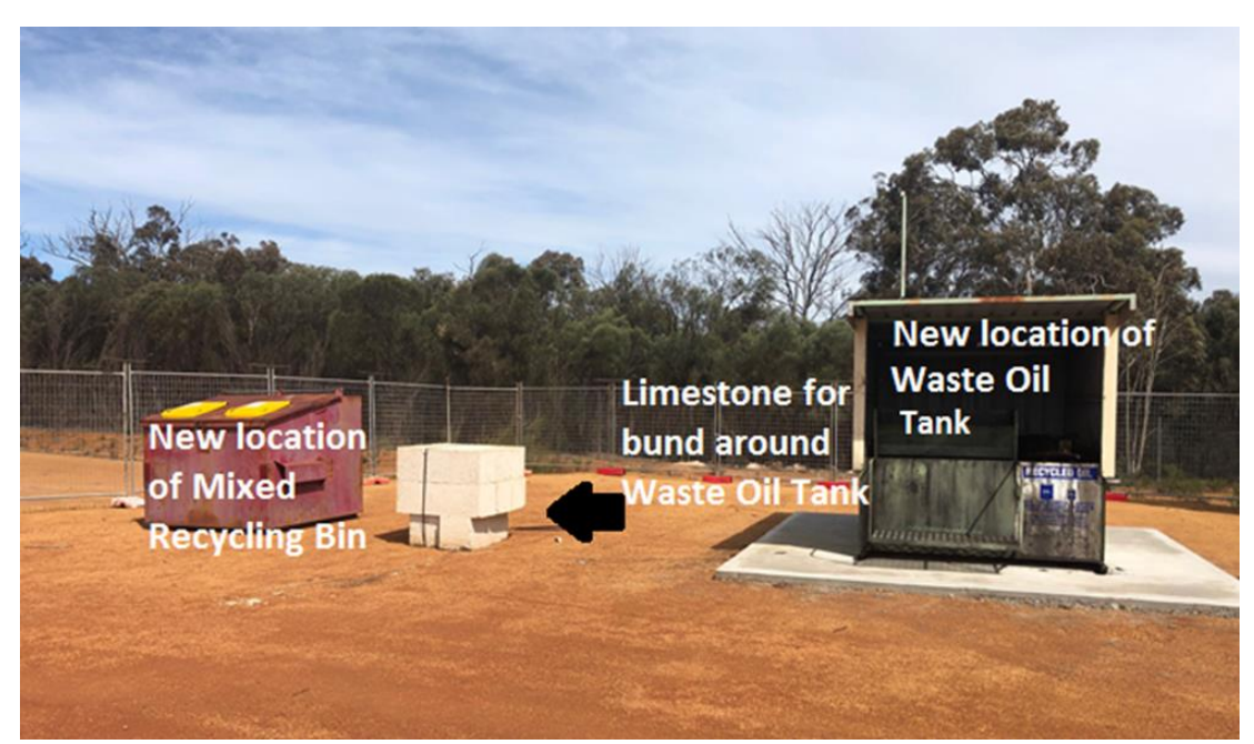
FIGURE 2 SHIRE OF WILLIAMS REFUSE SITE SEPTEMBER 2019, MIXED RECYCLING & WASTE OIL TANK RELOCATION.

Landfilling at the site ceased on the 4<sup>th</sup> September 2019. This aligned with the commencement of the Waste Services Contract with Avon Waste, on the 3<sup>rd</sup> September 2019. The landfill remained open, but unused for the month of September to ensure the Transfer Station was functional and the bulk bins and waste contractor met the Shire's requirements. During this time a site surveyor was engaged to map the site and determine the site's surface contours to guide future groundworks.