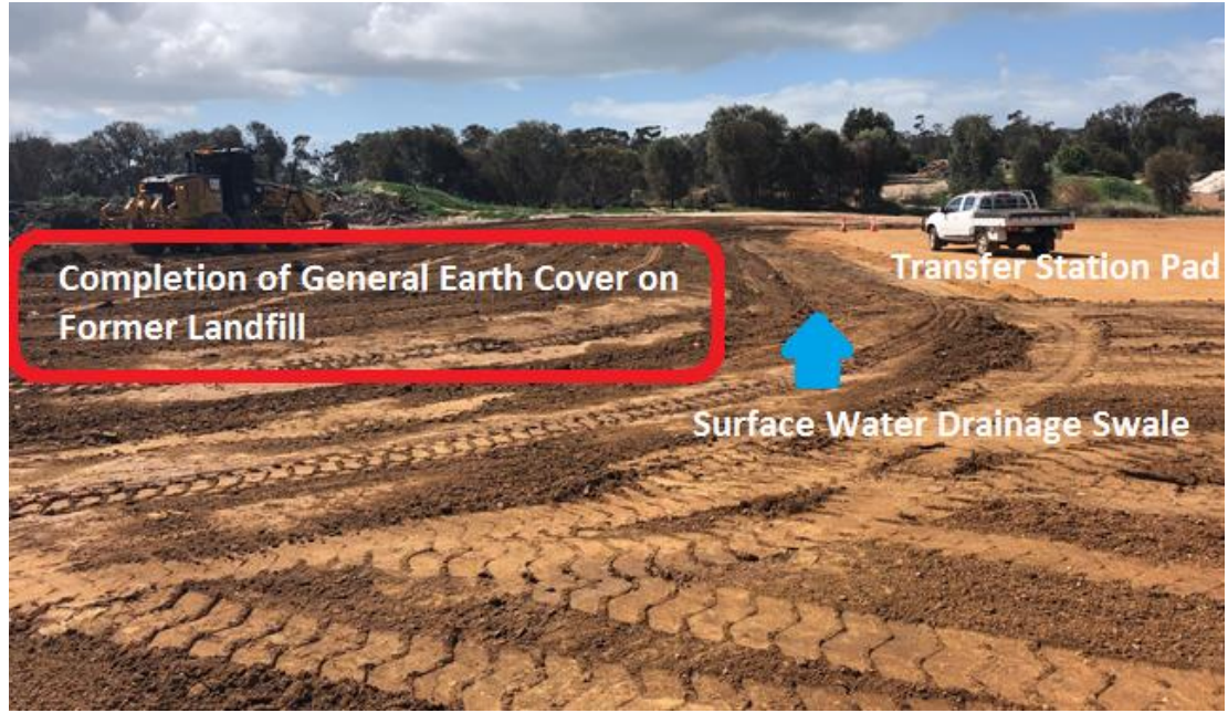
FIGURE 3 SHIRE OF WILLIAMS REFUSE SITE SEPTEMBER 2019, INITIAL LANDFILL COVER AND DRAINAGE SWALES.

After three weeks, Shire Staff were confident the Transfer Station was functional and meeting the Shire's needs. No complaints or incidents occurred on site. The Shire owns ten (10) bulk bins and only four (4) were filled over the month, so it had sufficient capacity for the incoming general waste. The landfill trench was then covered with approximately 200mm of clean fill as an initial cap. This clean fill was primarily from the Main Roads Bridgeworks project, and the clay content is an additional benefit to its use. Drainage swales were built to direct the surface water flow, and the site now remains unused, see Figure 3 below. The final capping will be constructed once the Shire's Closure Plan is approved by the Department of Water and Environmental Regulation (DWER).