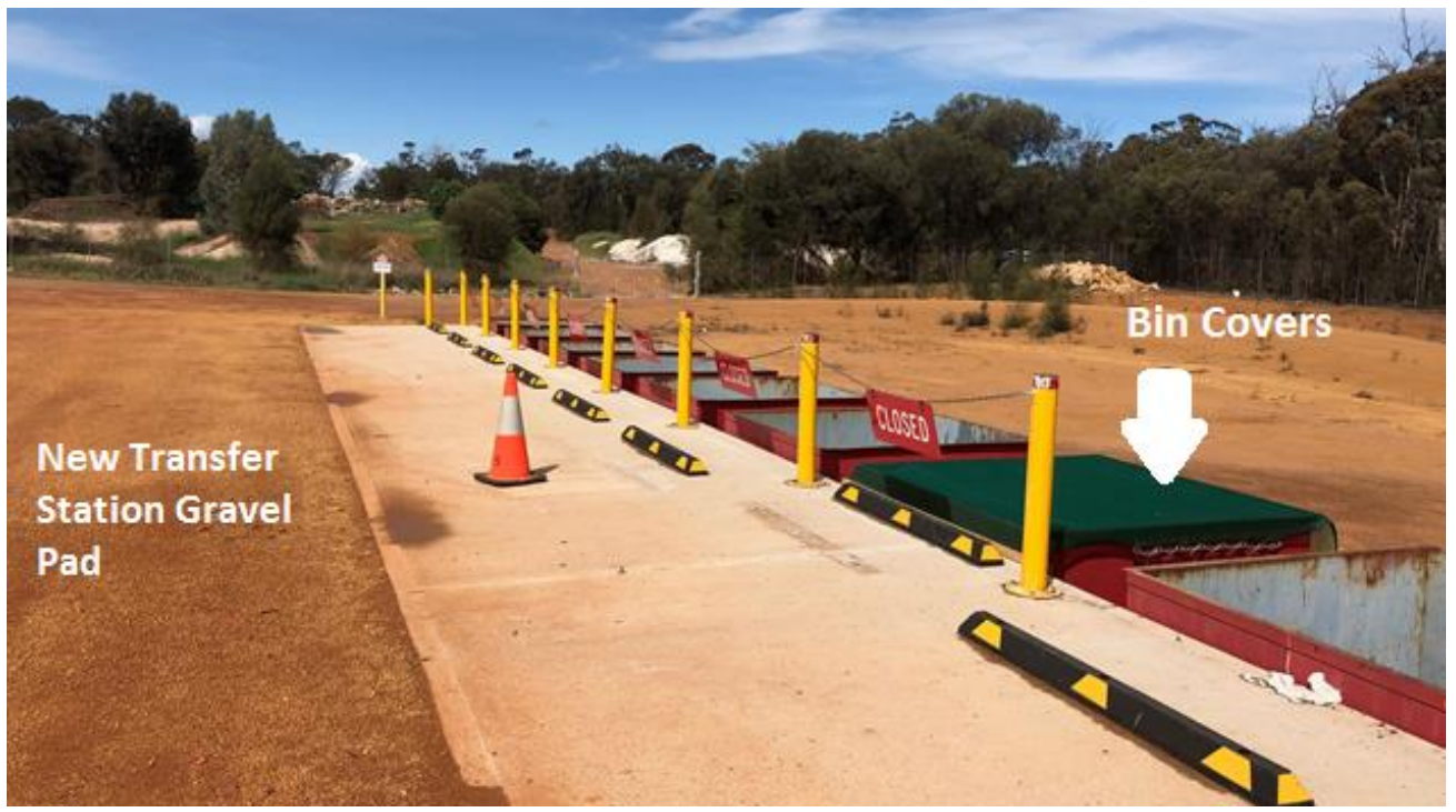
FIGURE 1 WILLIAMS REFUSE SITE SEPTEMBER 2019, TRANSFER STATION GRAVEL PAD AND BIN COVERS.

The Shire of Williams has been working towards closing its landfill since funding was secured for the transfer station cement pad and bulk bins in 2016. Site works were conducted in August in preparation for the opening of the transfer station. A gravel pad was laid, see Figure 1 below, to accommodate vehicle traffic, signs were installed, bin covers were built and notice was given to residents. While these works were happening the Shire took the opportunity to relocate the Waste Oil Tank from the Depot to a bunded concrete pad at the Waste Transfer Station and move the mixed recycling bin to a more accessible location, see Figure 2 below.